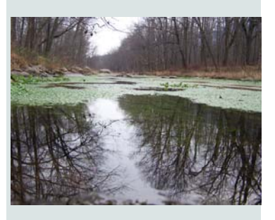
for possible stream management projects, and it lists management options for watershed leaders and

Volume III of the plan also identifies five locations needing special attention to be evaluated