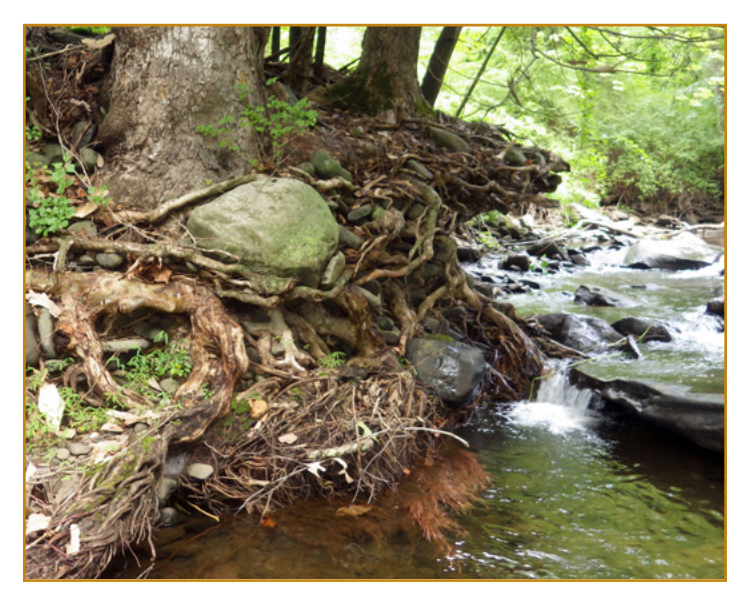
Above: Tree roots provide excellent bank stabilization and habitat on a tributary to the Esopus Creek the Little Beaver Kill, near Willow, NY.